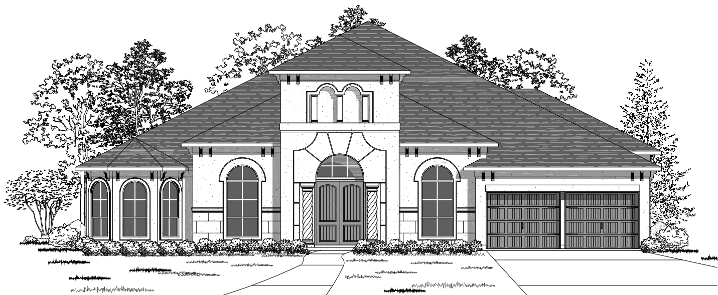
Design 4297S E-1

This design, as originally designed and prior to any changes you make, is estimated to yield approximately the number of square feet shown on page 1. All dimensions are approximate. Square footage may vary based on as-built dimensions, configurations, plan options and/or the method of calculation. Designs are not-to-scale, and are conceptual illustrations that may differ from construction plans or completed improvements. A design may depict features not available on all homesites or in all communities. Perry Homes reserves the right to make changes in plans and specifications, and to substitute material of similar quality. Prices, terms, promotions, plans, dimensions, features, options, amenities, elevations, designs, square footages, specifications, materials, and availability of homes or communities are subject to change without notice or obligation. All obligations will be governed by a written contract. This design does not constitute a commitment to build a particular floor plan or home in any given community. Some floor plans, options, and/or elevations may not be available on certain homesites or in a particular community and may require additional charges. Please check with Perry Homes to verify current offerings in the communities you are considering. This rendering is the property of Perry Homes, LLC. Any reproduction or exhibition is strictly prohibited. © Perry Homes, LLC 2015