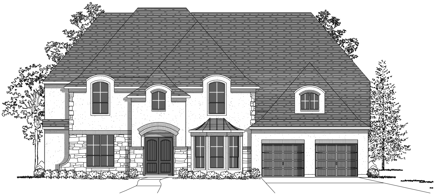
Design 4925S E-1