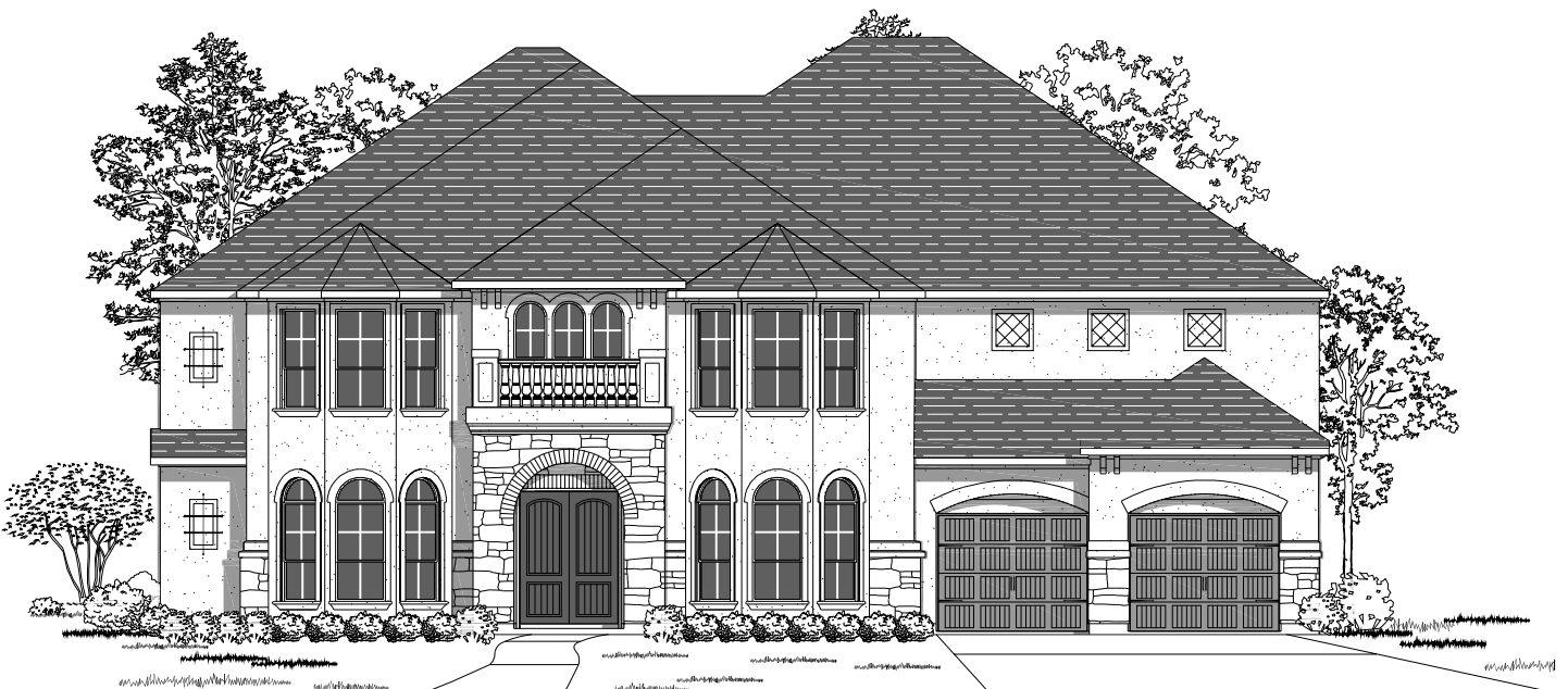
Design 4925S E-101

This design, as originally designed and prior to any changes you make, is estimated to yield approximately the number of square feet shown on page 1. All dimensions are approximate. Square footage may vary based on as-built dimensions, configurations, plan options and/or the method of calculation. Designs are not-to-scale, and are conceptual illustrations that may differ from construction plans or completed improvements. A design may depict features not available on all homesites or in all communities. Perry Homes reserves the right to make changes in plans and specifications, and to substitute material of similar quality. Prices, terms, promotions, plans, dimensions, features, options, amenities, elevations, designs, square footages, specifications, materials, and availability of homes or communities are subject to change without notice or obligation. All obligations will be governed by a written contract. This design does not constitute a commitment to build a particular floor plan or home in any given community. Some floor plans, options, and/or elevations may not be available on certain homesites or in a particular community and may require additional charges. Please check with Perry Homes to verify current offerings in the communities you are considering. This rendering is the property of Perry Homes, LLC. Any reproduction or exhibition is strictly prohibited.