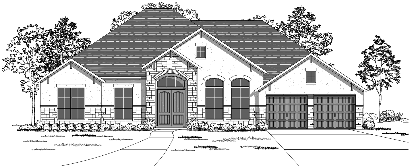
Design 3651S E-1

This design, as originally designed and prior to any changes you make, is estimated to yield approximately the number of square feet shown on page 1. All dimensions are approximate. Square footage may vary based on as-built dimensions, configurations, plan options and/or the method of calculation. Designs are not-to-scale, and are conceptual illustrations that may differ from construction plans or completed improvements. A design may depict features not available on all homesites or in all communities. Perry Homes reserves the right to make changes in plans and specifications, and to substitute material of similar quality. Prices, terms, promotions, plans, dimensions, features, options, amenities, elevations, designs, square footages, specifications, materials, and availability of homes or communities are subject to change without notice or obligation. All obligations will be governed by a written contract. This design does not constitute a commitment to build a particular floor plan or home in any given community. Some floor plans, options, and/or elevations may not be available on certain homesites or in a particular community and may require additional charges. Please check with Perry Homes to verify current offerings in the communities you are considering. This rendering is the property of Perry Homes, LLC. Any reproduction or exhibition is strictly prohibited. © Perry Homes, LLC 2014